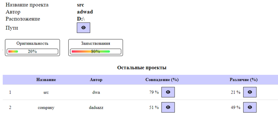
Fig. 3. The main form of the developed system.

per minute. We used the IntelliJ IDEA Statistic plugin to get the data for the experiment.