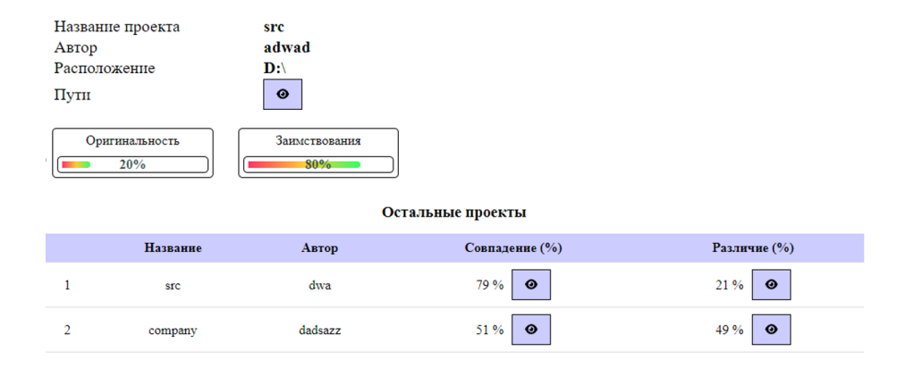
Fig. 3. The main form of the developed system.

per minute. We used the IntelliJ IDEA Statistic plugin to get the data for the experiment.